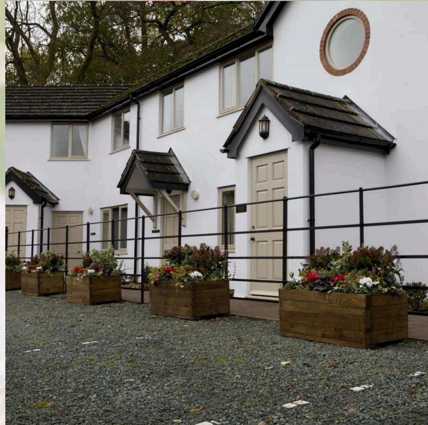
The Burlton Inn

The Burlton Inn have 6 ensuite rooms that can accommodate up to 12 people.