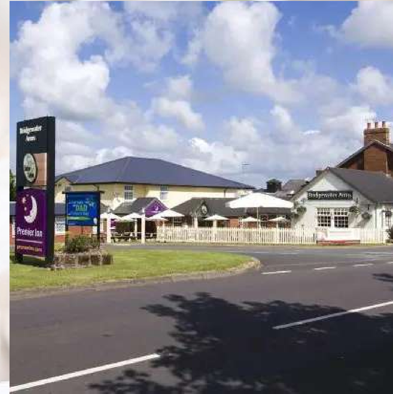
Premier Inn Harmer hill

The Premier Inn located in Harmer hill can accommodate for up to 80+ people