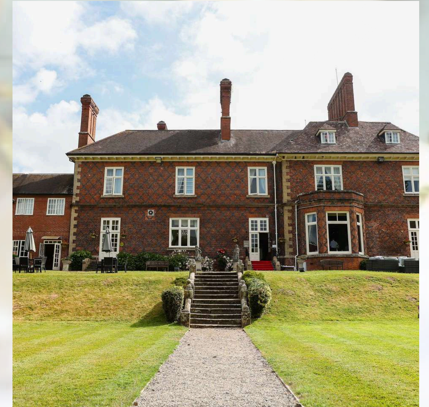
Albrighton Hall Hotel

Albrighton Hall Hotel & Spa, a member of Radisson Individuals, offers a beautiful countryside retreat, nestled within 15 acres of landscaped grounds. Located just four miles from the historic town of Shrewsbury