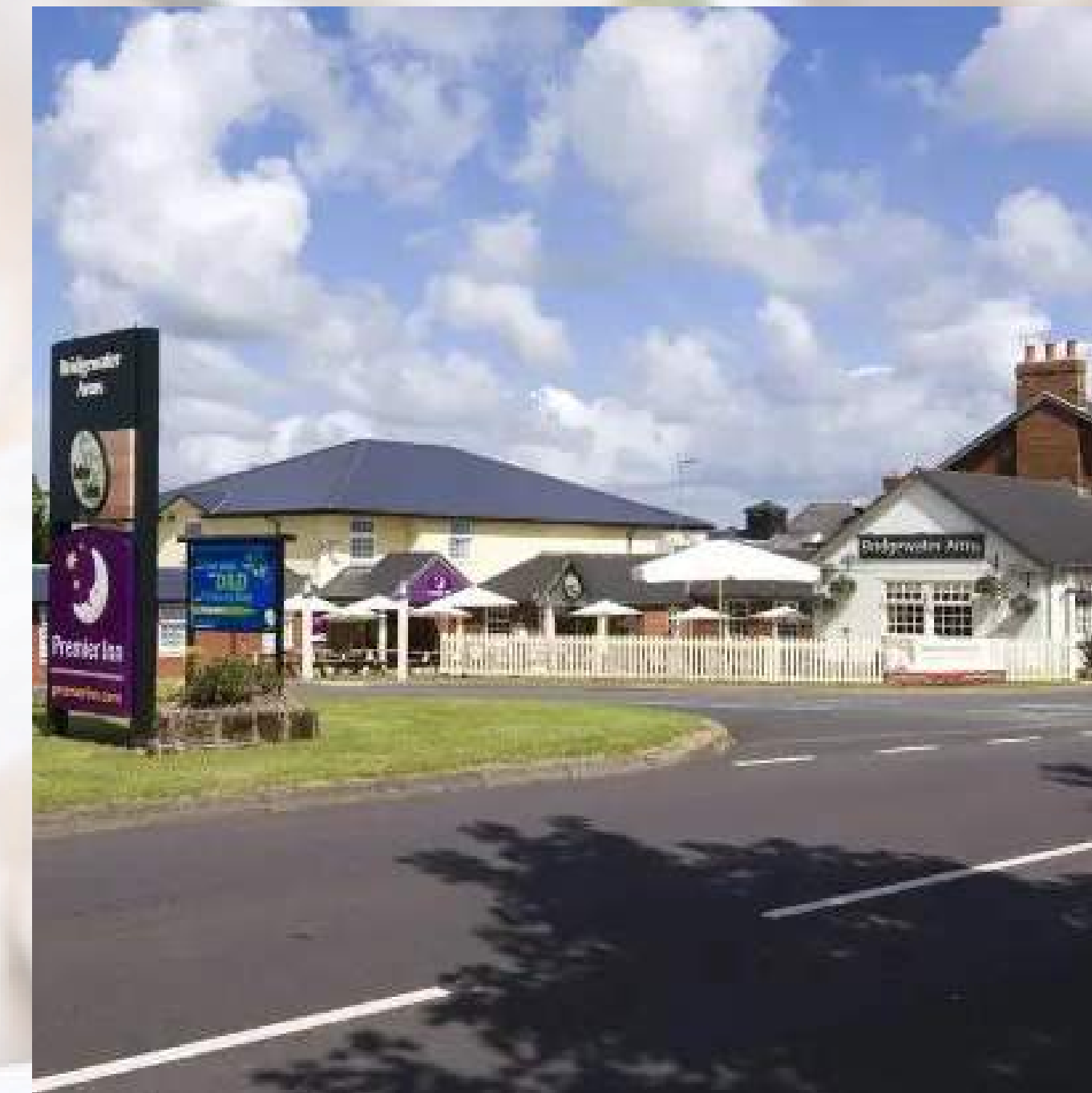
Premier Inn Harmer hill

The Premier Inn located in Harmer hill can accommodate for up to 80+ people