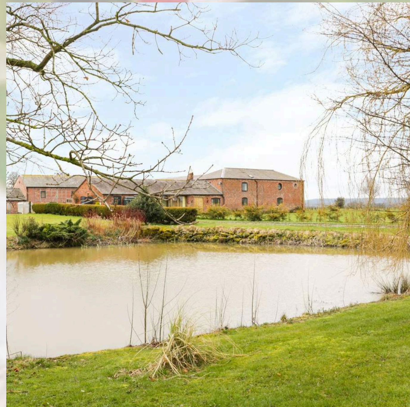
Kenwick Lodge Cottages

These large self-catering cottages can be booked in a group or individually.